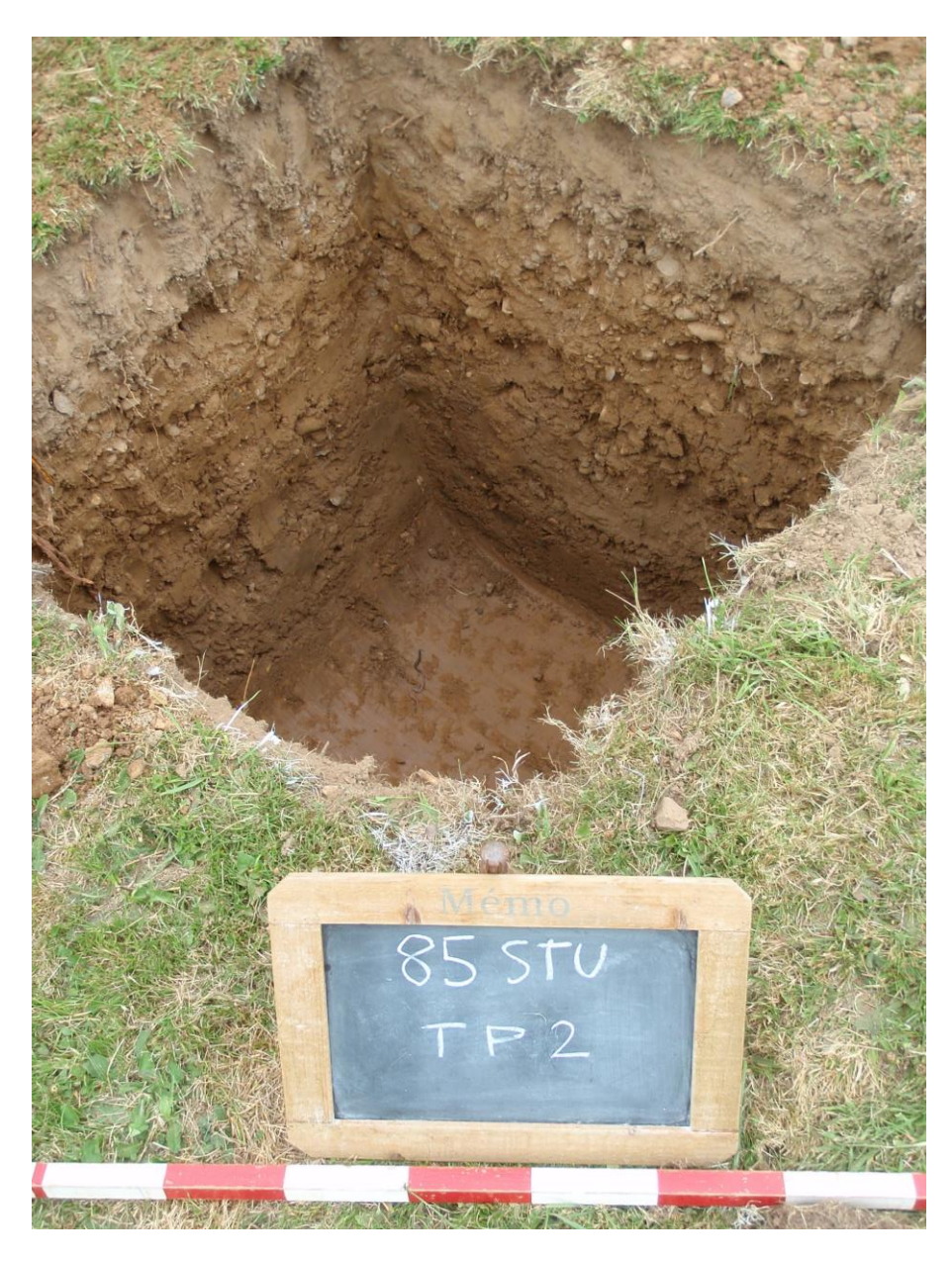
Plate 4. Test Pit 2