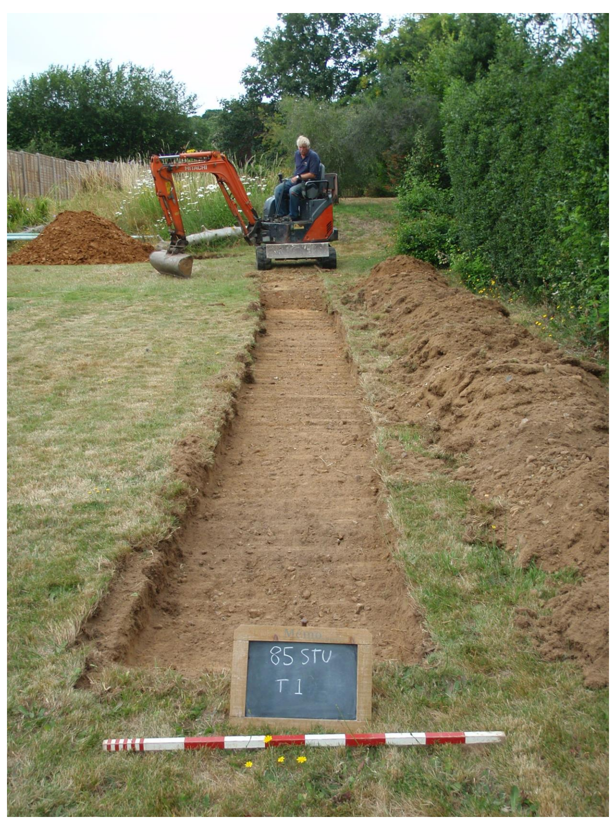
Plate 1. View of Trench 1 (looking N)