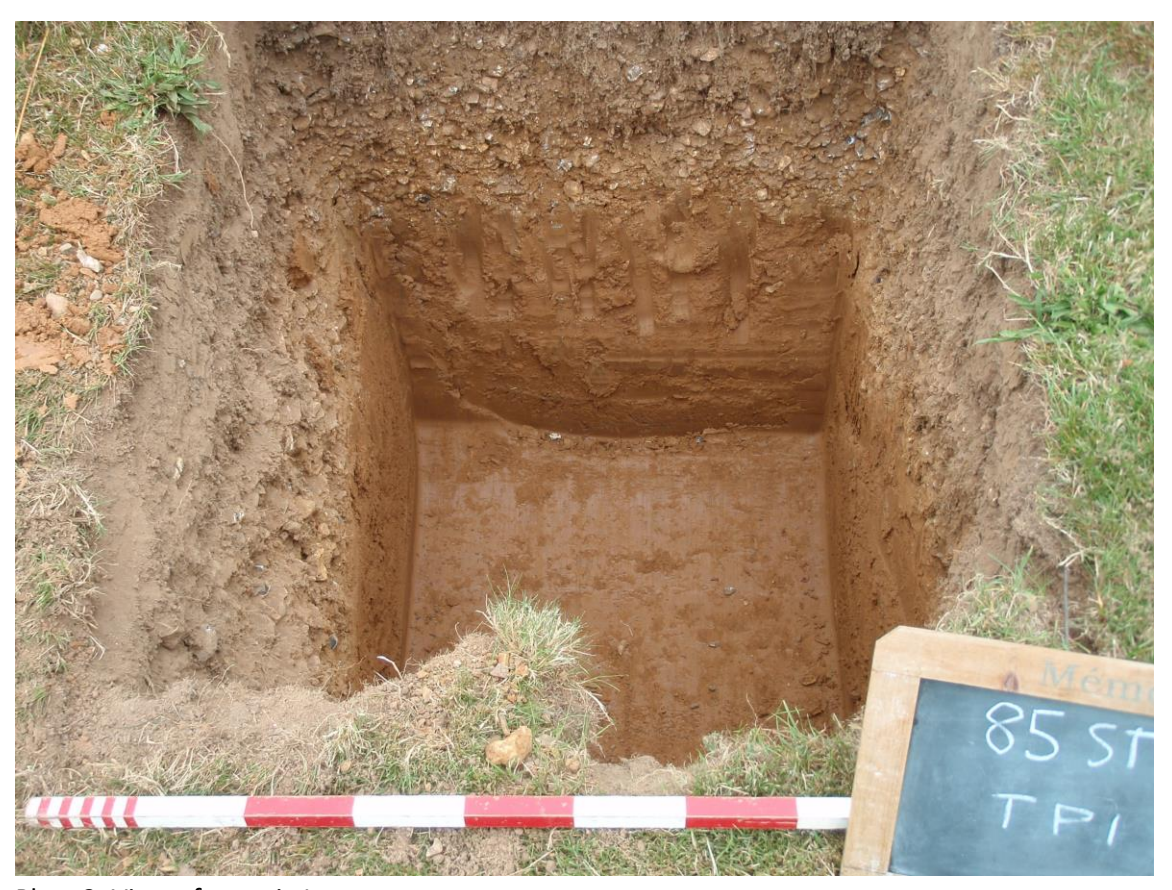
Plate 3. View of test pit 1