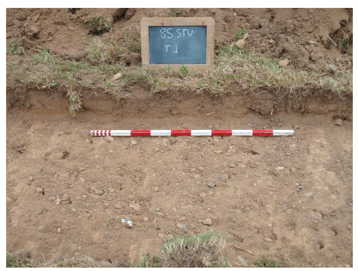
Plate 2. View of Trench 1 section. 1m scale (looking W)